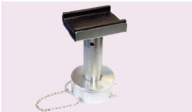
U-form adapter 150-233 mm