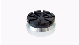
Height adapter 44 mm

*All technical data preliminary, lifts currently in development. Final details after product release.