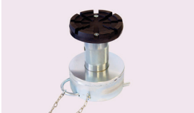
Height adapter 155-245 mm